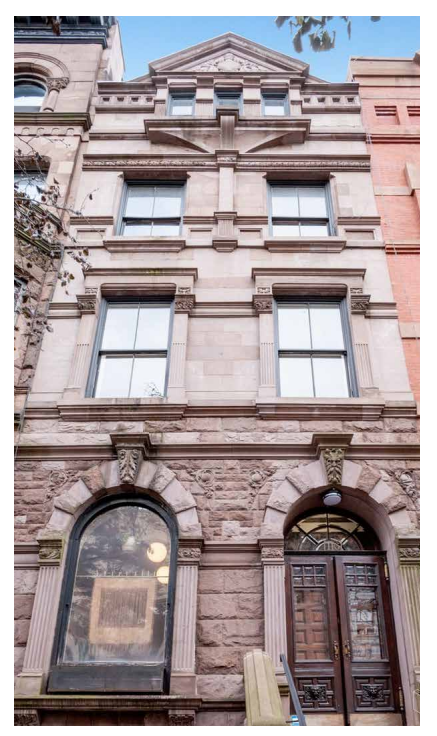
Halstead.com WEB# 19272215