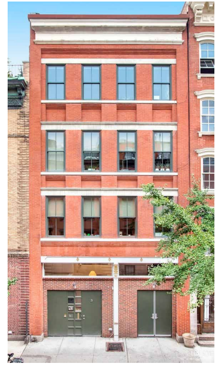
Halstead.com WEB# 18923067