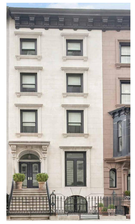
Halstead.com WEB# 19461493