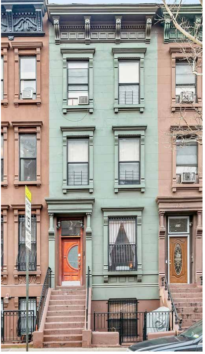
Halstead.com WEB# 19432409

Generally North of 96th Street on the East Side, and 110th Street on the West Side