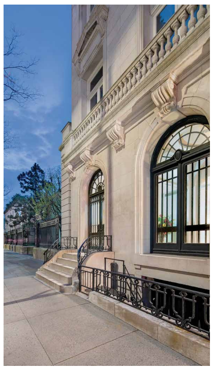
Halstead.com WEB# 19526323

Generally 59th to 96th Street, Fifth Avenue to the East River