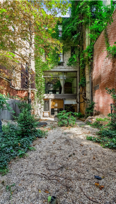
Halstead.com WEB# 18942541