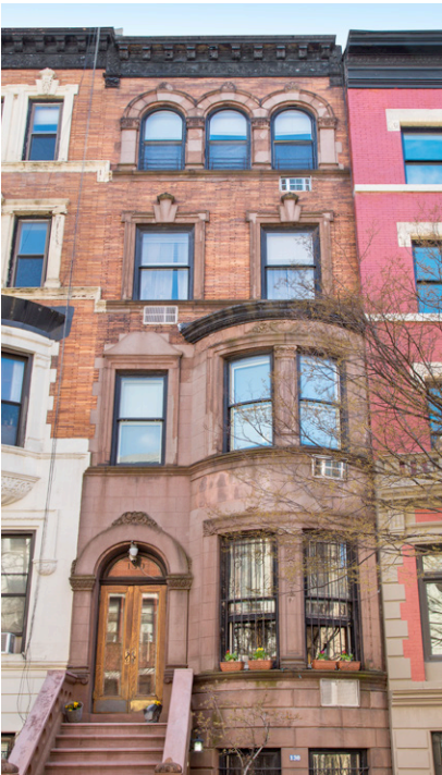
Halstead.com WEB# 19526362

Generally 59th to 110th Street, Hudson River to West of Fifth Avenue