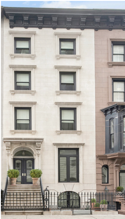
Halstead.com WEB# 19461493