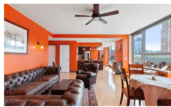
halstead.com WEB# 19503542

The average price rose 16% from a year ago, to $1,140,424.